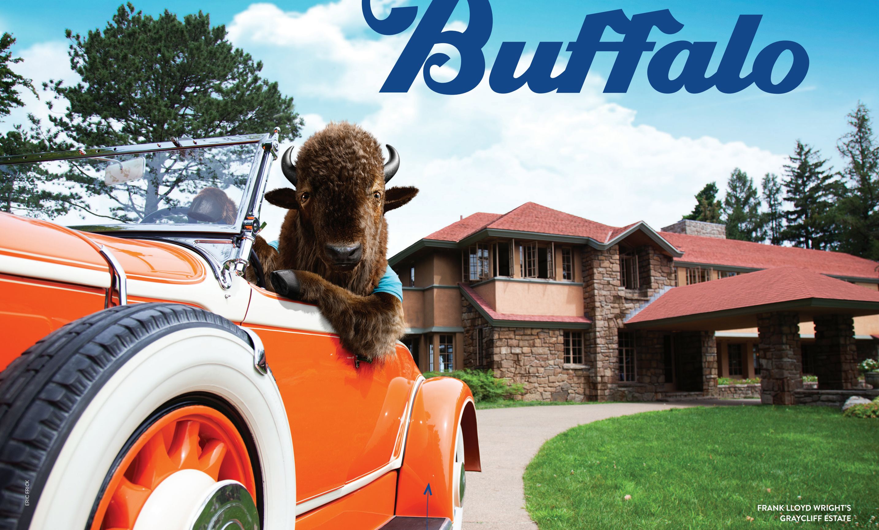
FRANK LLOYD WRIGHT'S GRAYCLIFF ESTATE

Whether you think you already know Buffalo or not, it's always going to surprise you. I've been here my whole life and every day I still find somewhere new to go and something new to do. There's amazing architecture, incredible art, delicious food, natural beauty, and some of the nicest people anywhere.